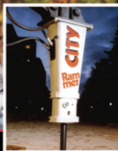
Sandvik (Rammer) S-Series hydraulic impact hammers