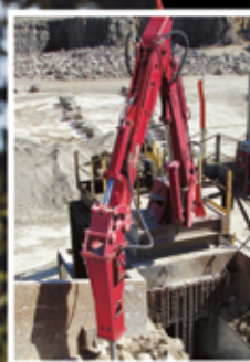
Pedestal Breaker System™ stationary boom systems