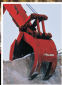
Contractor's Mechanical Grapple material and waste handling systems