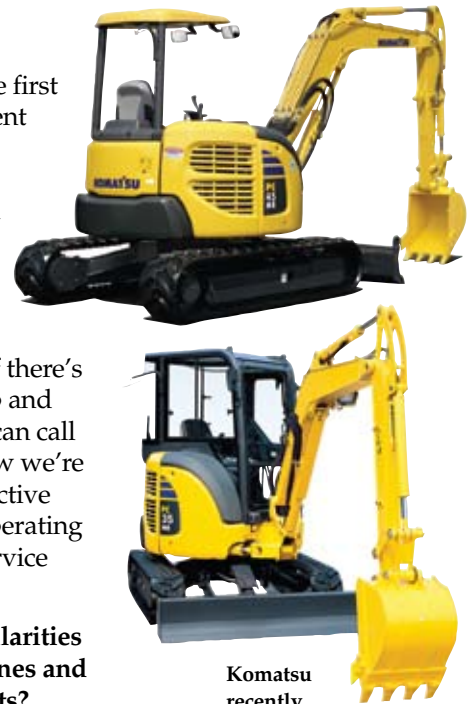
Komatsu recently introduced its new MR-3 series of compact excavators. The units are packed with features that offer better productivity and operator comfort.

ANSWER: Customers will find that even though we're a relatively new player in the utility market, our smaller machines are just as reliable and productive as Komatsu's larger models. No matter what size the machine, the same Komatsu development and testing process is applied. Whether a skid steer loader or 40-ton excavator, the process is the same. There's also a high degree of component commonality and Komatsu is known for its in-house hydraulic systems. That means customers will get the same quality and reliability from our smallest PC09 excavator as they will with our largest mining machine. It's part of Komatsu's commitment to quality equipment, product support, parts and service throughout its entire lineup. ■