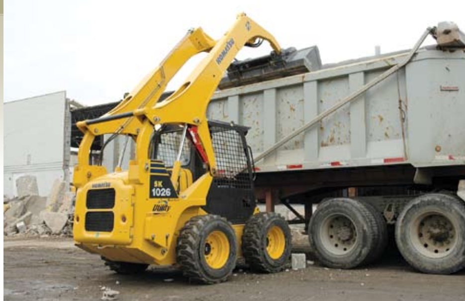
Komatsu's Newberry, S.C., manufacturing facility is the worldwide development center for skid steer loaders. Komatsu will introduce its next-generation, Tier 3-compliant skid steers later this year.

ANSWER: Like much of Komatsu's larger construction equipment, utility machines