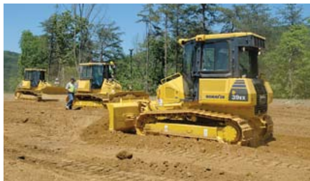
The new Dash-22 series dozers (D39 and D51) were among the machines featured at a recent Komatsu Demo Days event.

For more information on any of these units, feel free to call your sales representative or visit our nearest branch location. In many cases, if you'd like to try something out, we'll be able to set up a demo for you. ■