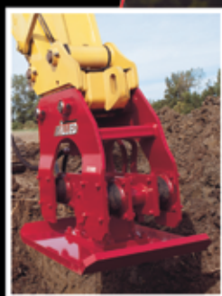
Ho-Pac® vibratory compactor/drivers