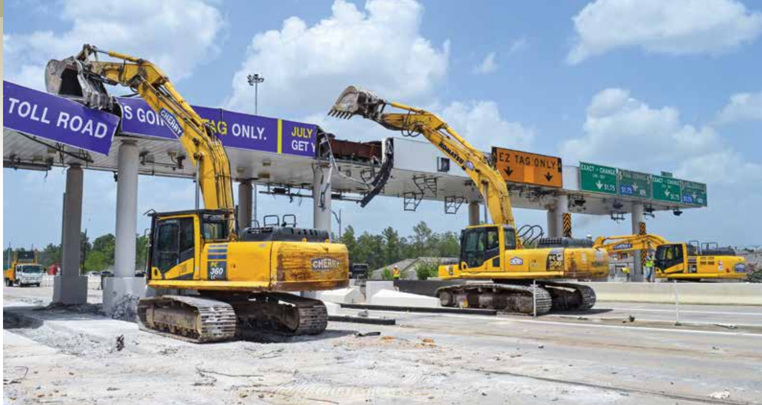
Cherry Companies often use multiple Komatsu excavators to meet production during operations such as when it demolished a toll plaza in the Houston area. “The durability really stands out. This application is hard on machinery, and Komatsu runs all day, every day,” said Field Superintendent Claxton “CJ” Jay.

are also the largest independently owned company in every market we serve, and that’s something we are very proud of. We have no intention of slowing down, either.”