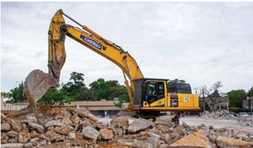
Operators perform pavement removal from roadways, parking lots and more with Cherry Companies' Komatsu excavators.