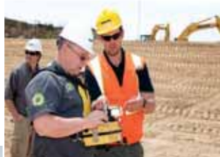
Attendees could operate all equipment, including the D155AXi-8 RC dozer, which is controlled remotely via a radio transmitter.

dozers, and this event showcased the second generation of that machine. The new D61i-24 model features a Tier 4 Final engine that reduces fuel consumption and operating costs. Additional new dozers included the D85i-18 and the D155AXi-8 RC (radio control) that is operated remotely via a radio transmitter.