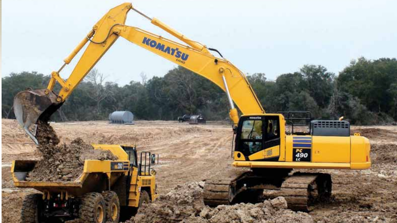
Owning and Operating Cost Comparison Among Komatsu Excavators