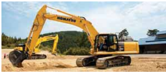
Among the machines featured was the popular 30-ton class size PC360LCi-11.

Komatsu introduced its first intelligent Machine Control products three years ago with the D61i-23