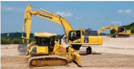
Komatsu introduced its second-generation intelligent Machine Control D61i-24 dozer, along with a new PC490LCi-11 excavator.